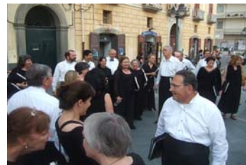
Singing in the street prior to CIC's first Carmina concert in Maori, Italy

For CHCC's first-ever European Tour (renamed CIC for the occasion), a group of 51 folks toured Pompeii and the Amalfi coast, joined five other choirs in two performances of Carmina Burana, and presented two performances of a program called Soulful Sounds in the Chiesa di Sant'Agnese in Agone in Rome and in the Scuderie Aldobrandini in Frascati. They even sang a few selections in the Sistine Chapel!