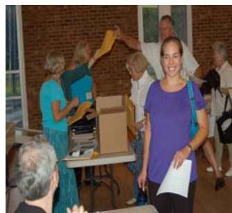
Singers excited about a new year

On behalf of the Board, I want to thank you for joining us. Sing well!